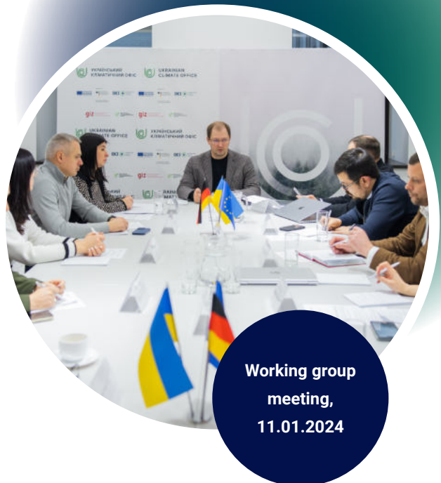
Working group meeting, 11.01.2024

Conducting frequent consultation meetings is crucial and already common practice apart from sectors impacted by martial law. We recommend consistently facilitating workshops and consultations that involve representatives from government agencies, private sector entities, environmental NGOs, and local communities. This should not be an ad-hoc